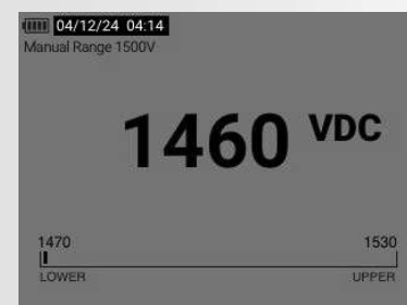
Limit gauge – outside of range